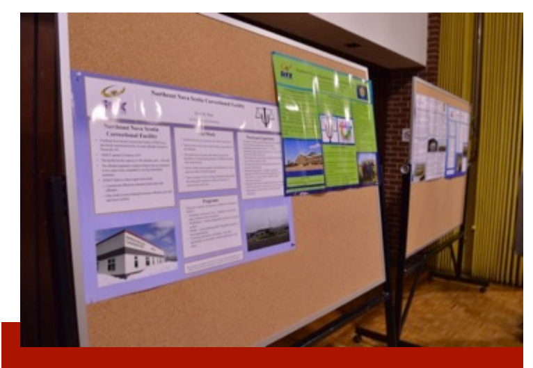
A few of the posters prepared by practicum students