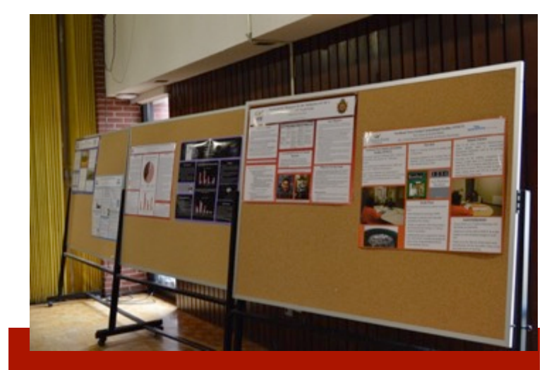
A few of the posters prepared by practicum students

In short, Forensic Psychology Day @ X was filled with opportunities for students and professionals and community members alike. Students were able to get a better understanding of different career paths, demonstrate their current research/placements, and celebrate their placement supervisors. Professionals were able to network. Community members got an inside look at the broad scope of topics at the interface of psychology and law.